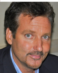
Call (843) 747-4111. © 2010 American Drug Testing

is published by American Drug Testing, a leading drug-free workplace administrator and testing company.